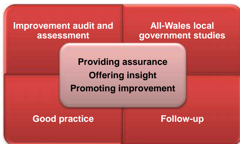
Exhibit 4: Components of my performance audit work